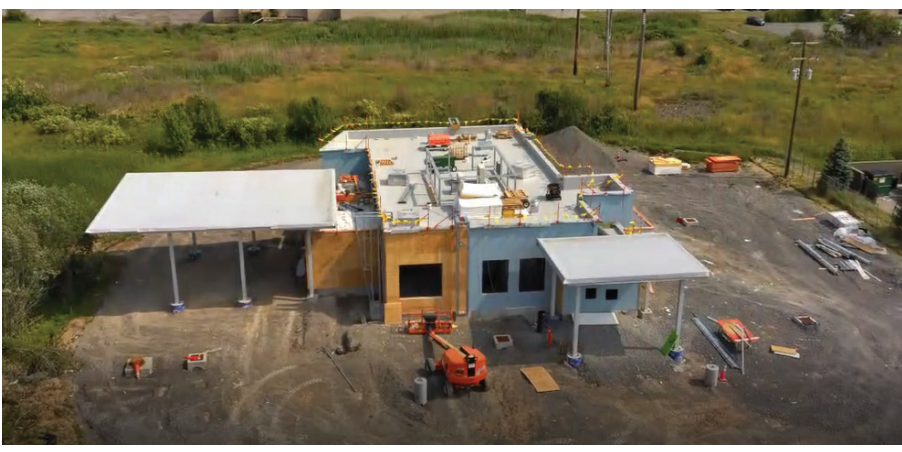
Teller Building Under Construction