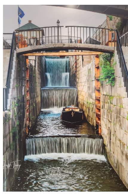
Lockport Locks Mural

Concept Construction would like to thank each and every one of the many subcontractors and suppliers who contributed to this amazing building as well as our internal project management team, our